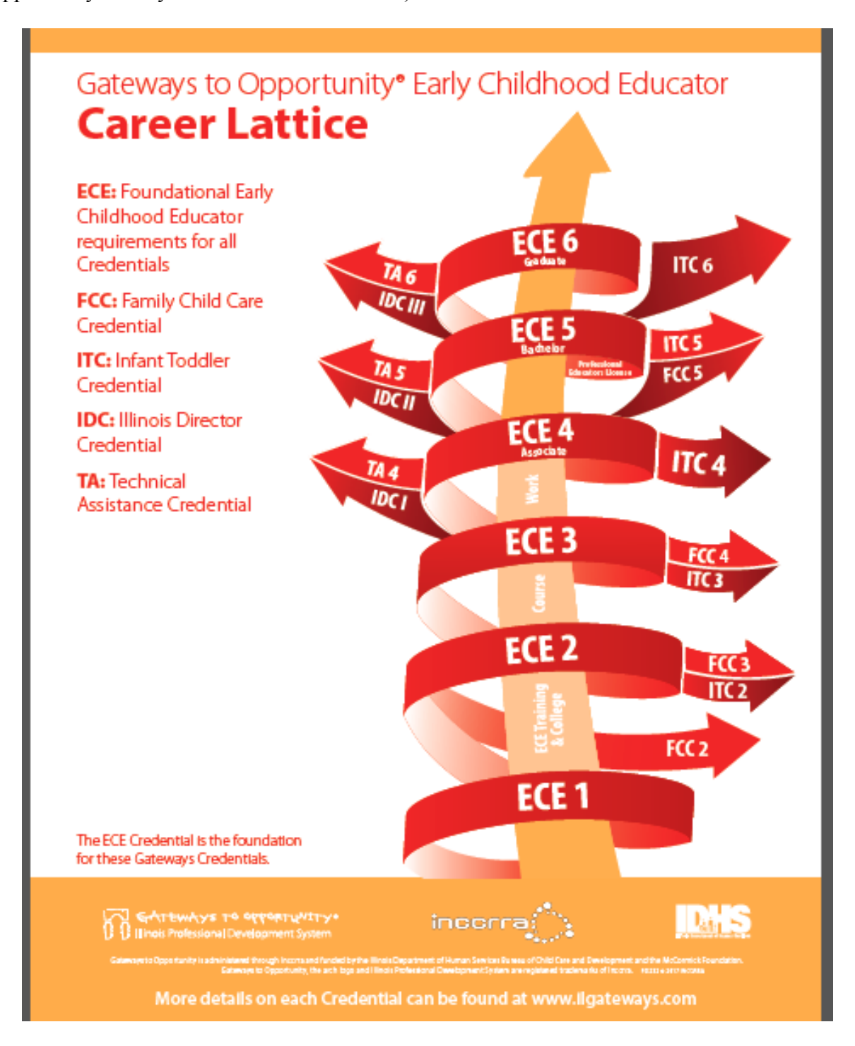
Figure 1. Gateways to Opportunity® Early Childhood Educator Career Lattice

across the state, as well as promote ongoing educational attainment. (See Figure 1: Gateways to Opportunity® Early Childhood Career Lattice).