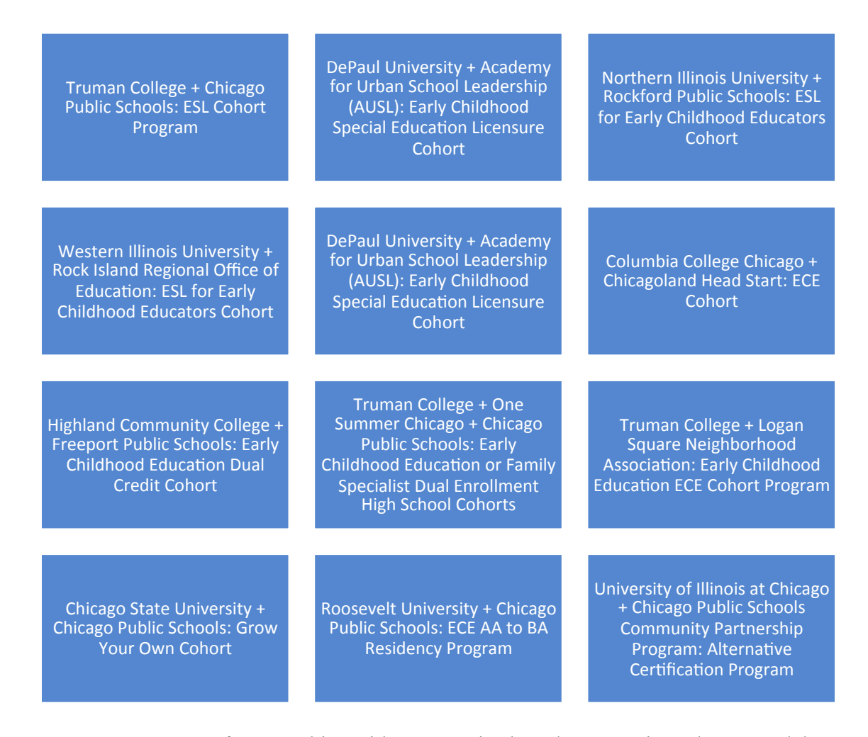
Figure 3. Types of partnerships with community-based partners in pathway models

When partnering with community-based partners, nine models were created and supported in partnership with local school entities, including two partnerships with local high schools for dual-credit programs (i.e., the Highland Community College + Freeport Public Schools: Early Childhood Education Dual Credit Cohort and the Truman College + One Summer Chicago + Chicago Public Schools: Early Childhood Education or Family Specialist Dual Enrollment High School Cohorts) and seven partnering with public school systems to recruit educators for advanced degree/ license/ credential including the Columbia College Chicago +