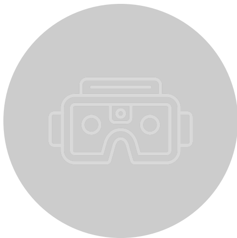
SESSION TWO Future Framing