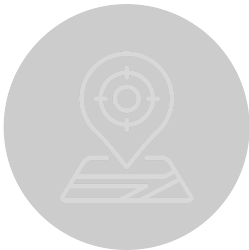
SESSION ONE Understanding the System