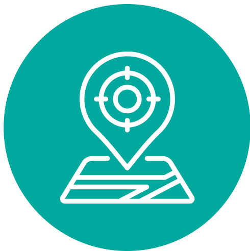
SESSION ONE Understanding the System