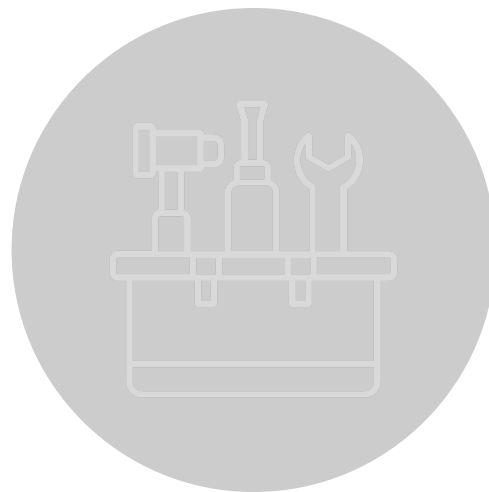
SESSION THREE Prototyping