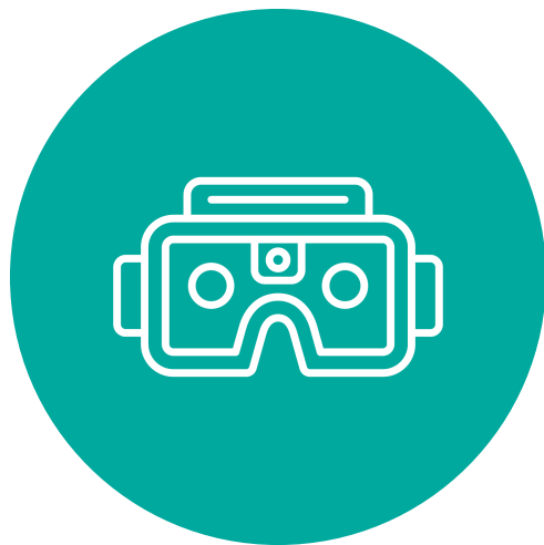
SESSION TWO Future Framing